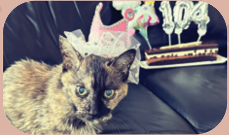
JC Cat, Evanston