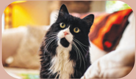
Tuxedo Joe, Cranston

To have your pet featured, email news@mycalgary.com