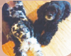
Blue and Jere, Mount Pleasant