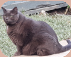
Big Earl, Capitol Hill