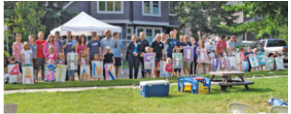
Photo from 2013 via HSCA Flood Task Force 4A Street thanks flood volunteers

To quote our 2013 Annual Report, "the Calgary Flood redefined volunteerism and what it means to be a community hero". While we are not able to gather for in-person events this June 19 for Neighbour Day, we look forward to hearing some of your ideas for socially distanced celebrations of community. Remember to tag us online at #HSCAyy!