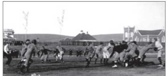
Calgary Tigers, the precursors to the Stampeders, playing football at Hillhurst Athletic Park, 1913

SCAN HERE TO VIEW ADDITIONAL CONTENT: NEWS, EVENTS, CRIME STATS, REAL ESTATE STATS, & MORE