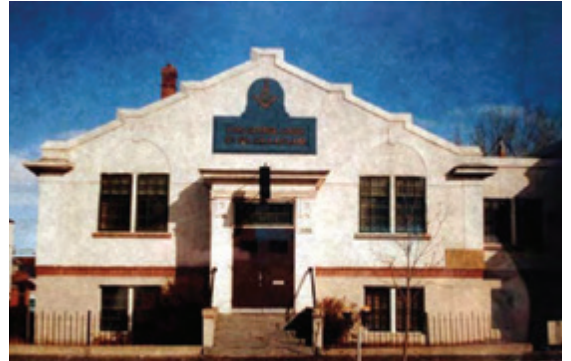
King George Masonic Lodge No 59, n.d.